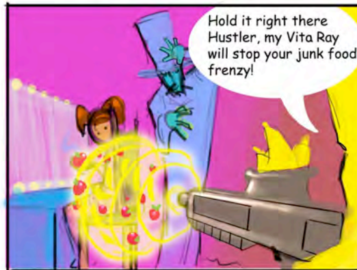
Hold it right there Hustler, my Vita Ray will stop your junk food frenzy!