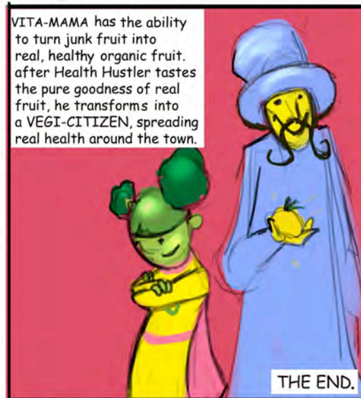
VITA-MAMA has the ability to turn junk fruit into real, healthy organic fruit. after Health Hustler tastes the pure goodness of real fruit, he transforms into a VEGI-CITIZEN, spreading real health around the town.