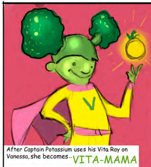
After Captain Potassium uses his Vita Ray on Vanessa, she becomes... VITA-MAMA