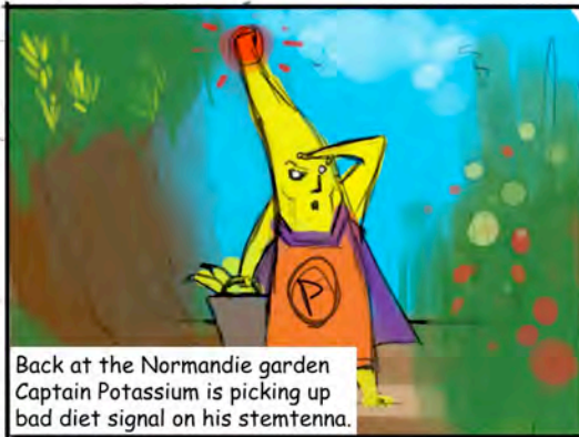
Back at the Normandie garden Captain Potassium is picking up bad diet signal on his stemtenna.