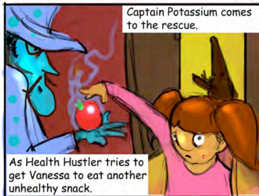
Captain Potassium comes to the rescue.